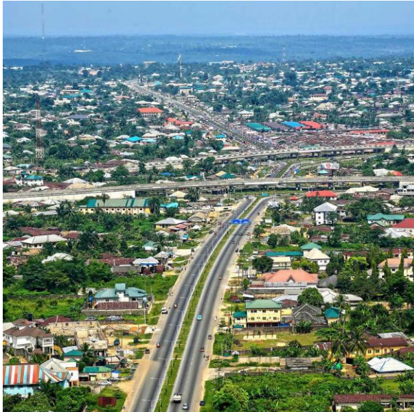
Aerial view of Uyo, Akwa Ibom state.

A team of Nigeria-based scientists has set out to establish such a laboratory. The scientists' goal is to open a water-quality monitoring laboratory that eventually receives international accreditation. A delegation of scientists visited the United States in the fall of 2015 to engage in networking, learn about opportunities for financial assistance, and acquire technical knowledge to help bring this laboratory to fruition. To the scientists' best understanding, the laboratory will be the first in Nigeria to meet U.S. EPA standards.